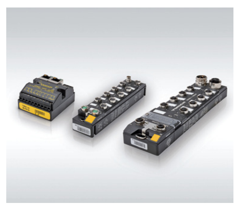
Industry 4.0 tools: Turck's I/O module series FEN20, TBEN-S and TBEN-L are not only suitable for multiprotocol operation, but can also be used as intelligent FLCs