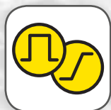
Multiple Signals, Digital and Analogue

Avoid cable damages, cuts or unreliable connections with a wireless communication. Avoid expensive installation time by digging or routing cables with the SureCross solution.